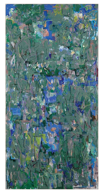
2011, Oil, Acrylic on Cotton, 72 x 36 inches

The painting is an elongated vertical overview in the dusky greens of distant misty forests. Gaps and openings of blue suggest the presence of water seen through the woodlands. The brushiness of the paint structures the work in painterly passages, rather than by needs of depiction. The verticality of the work suggests height, a view seen from above. This abstract painting refers to a specific New York State landscape. Finally, an angular configuration is superimposed on the front plane of the canvas, floating like a phantasm – a reminder that thought and emotion form our experiences of a physical view.