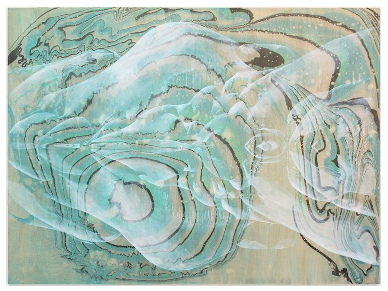
East, 2015, acrylic on panel, 30" x 40".