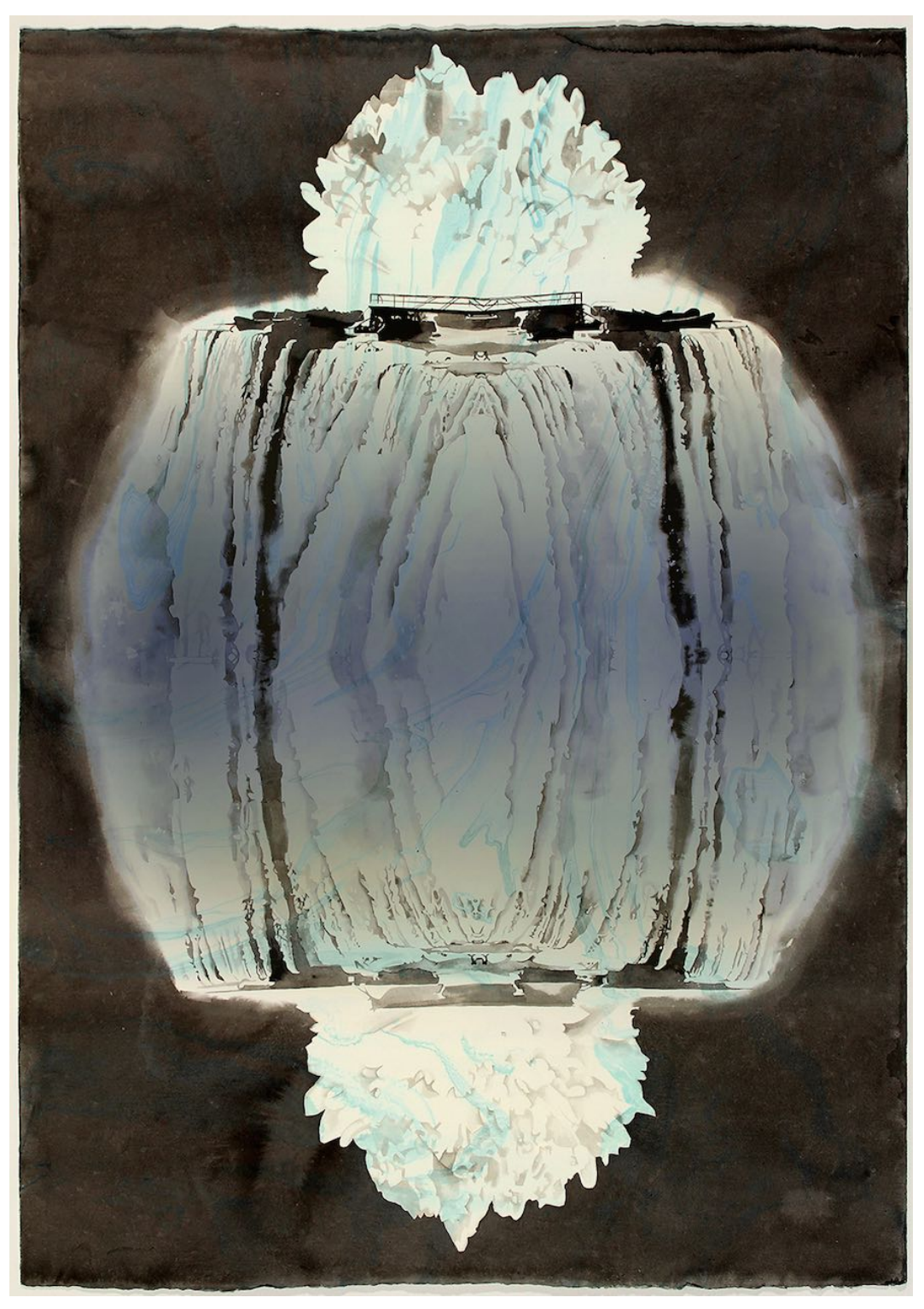
Dynamo, 2015, watercolor on paper, 41" x 30".