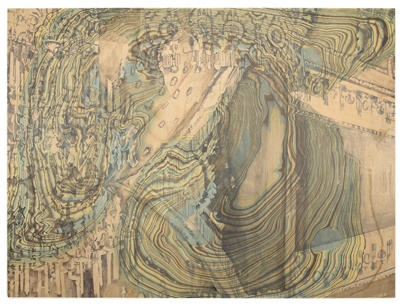
North, 2015, acrylic on panel, 30" x 40".