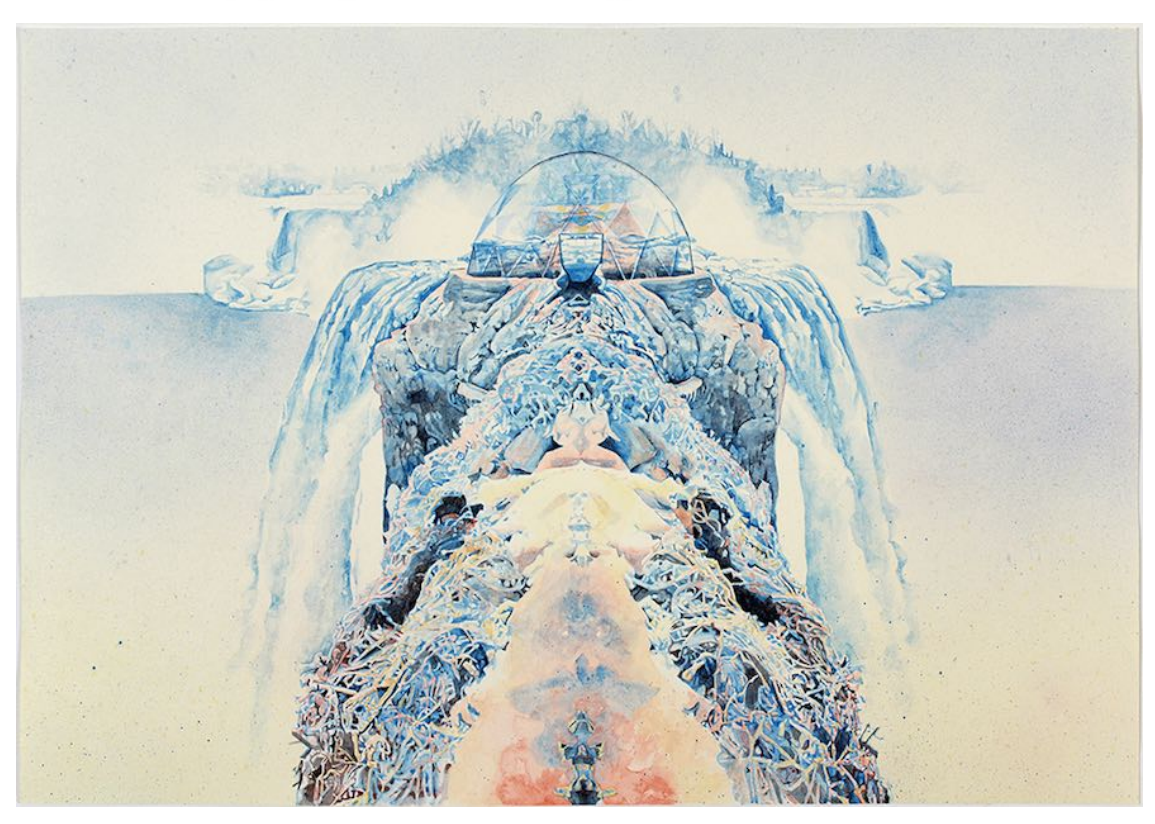
Dome, 2014, watercolor on paper, 18" x 22".