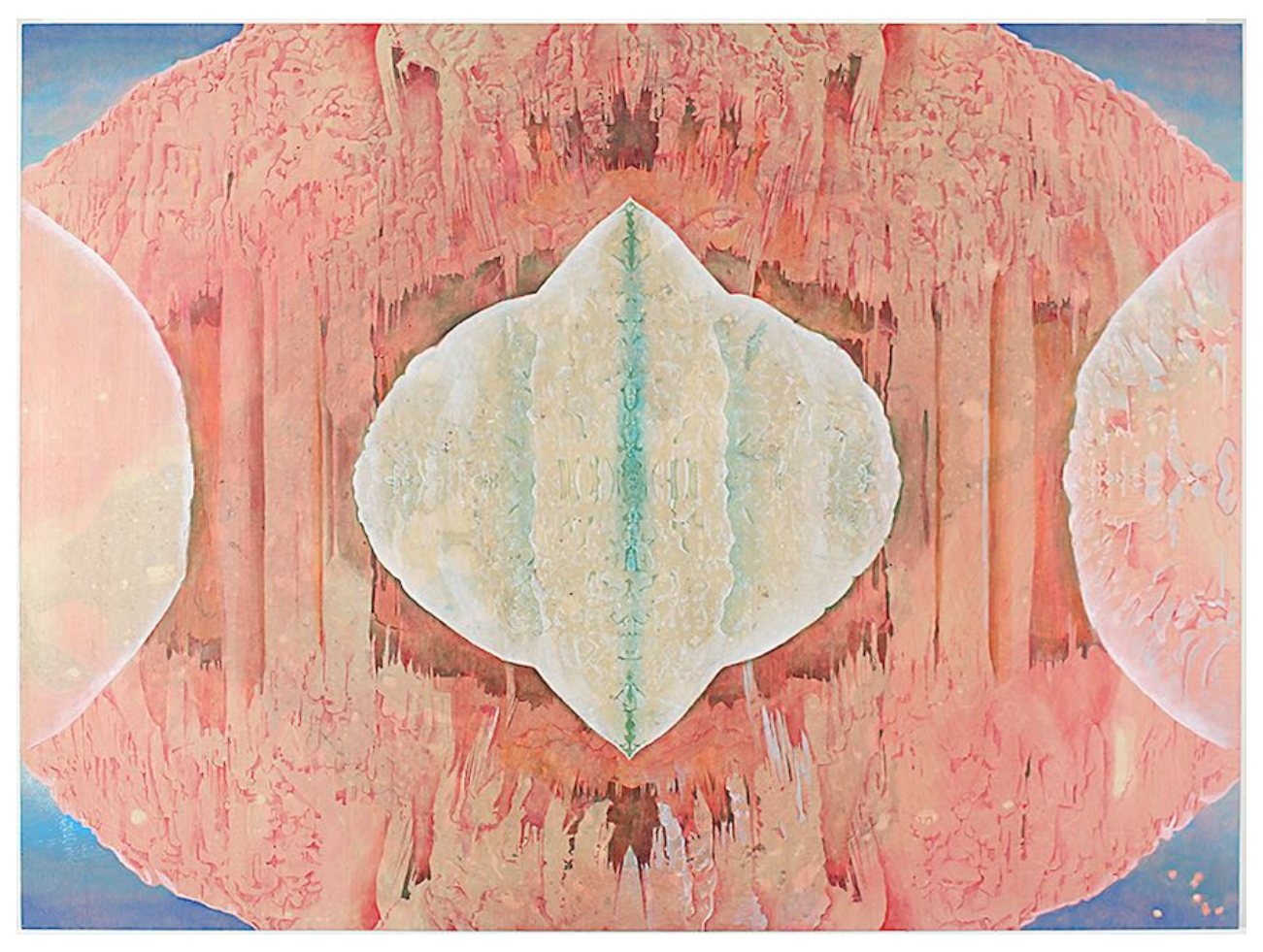
South, 2015, acrylic and oil on panel, 30" x 40".