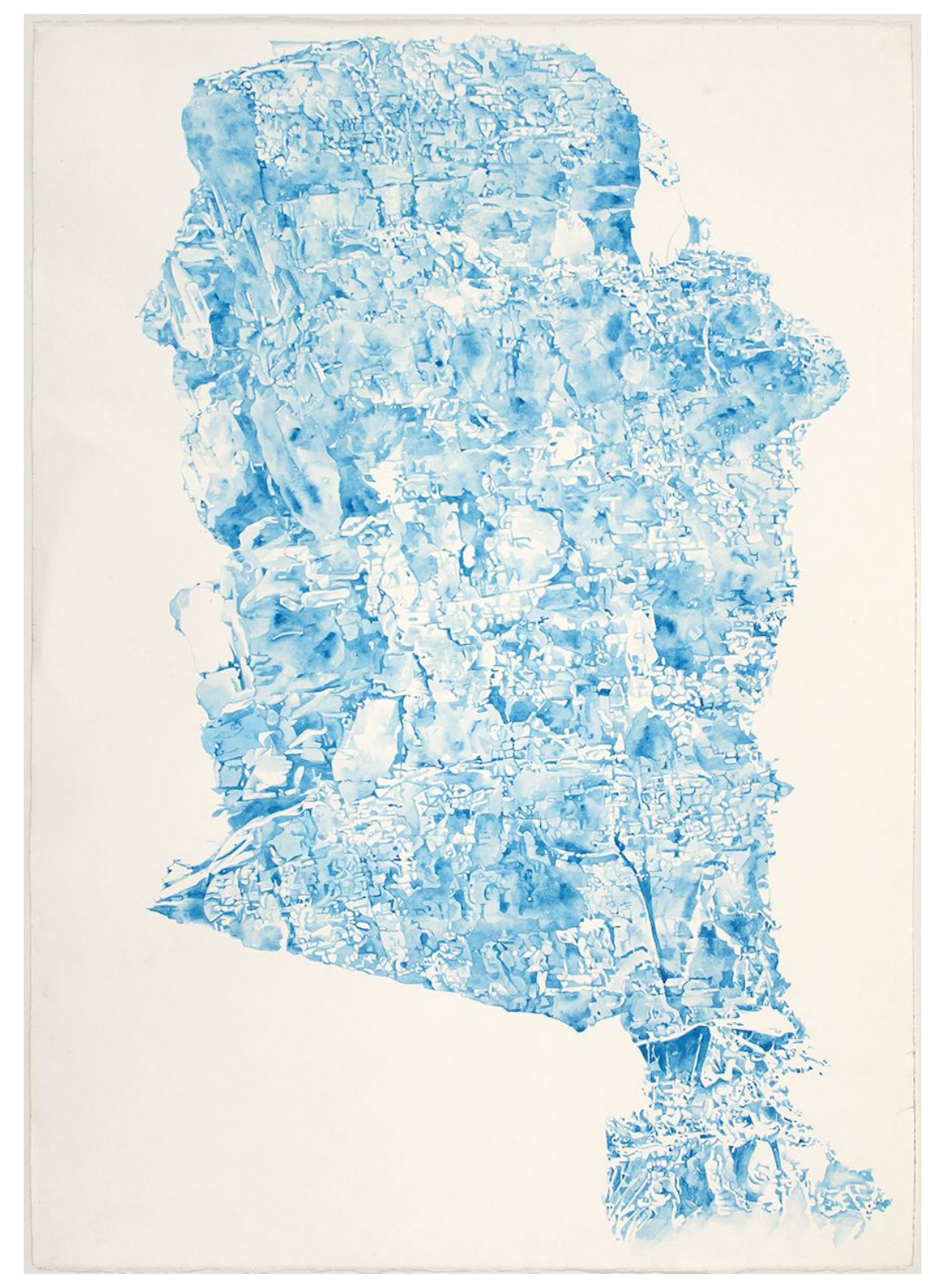
Blue Rock, 2014, watercolor on paper, 41" x 30".