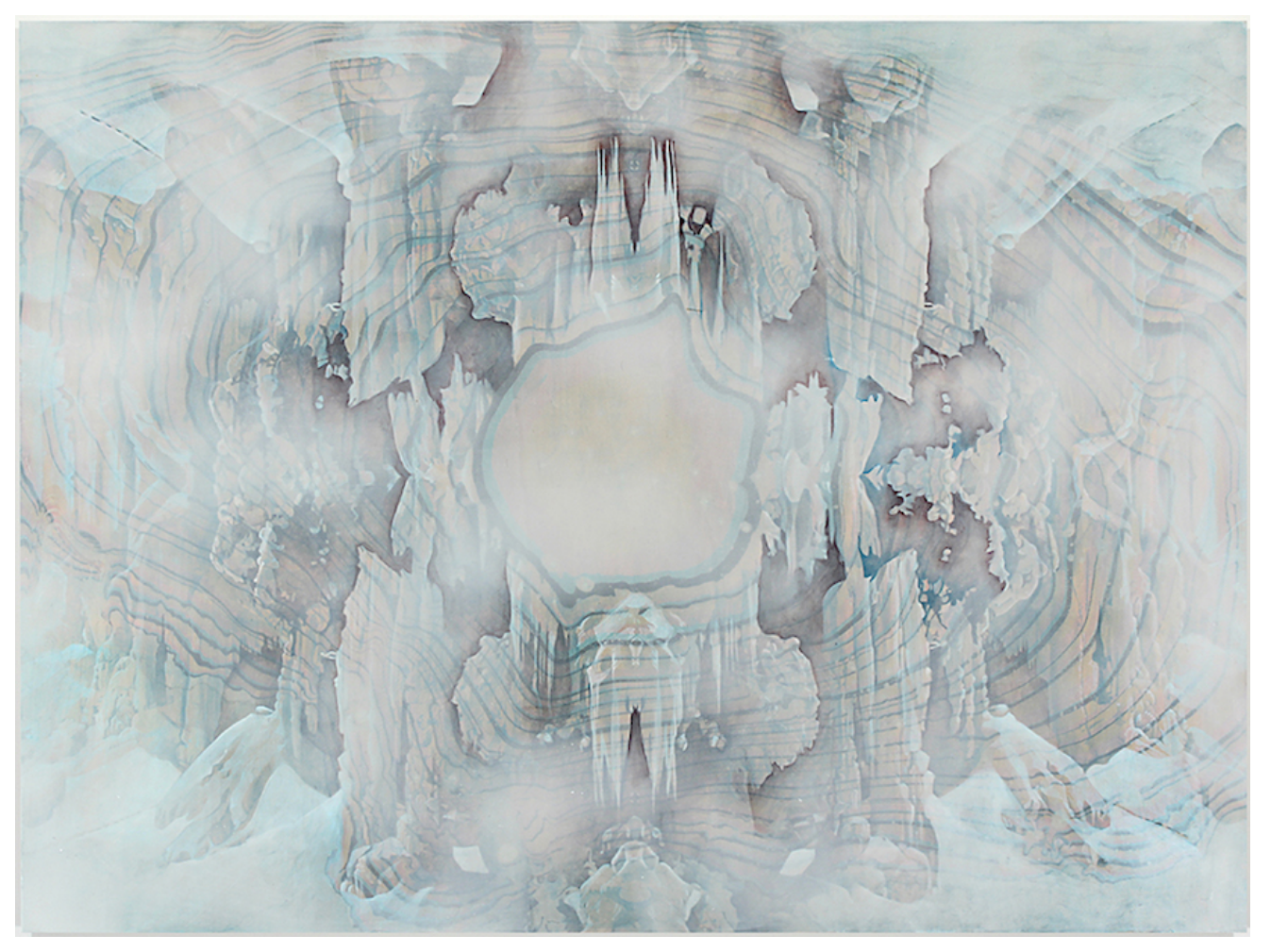
West, 2014, acrylic and oil on panel, 30" x 40".