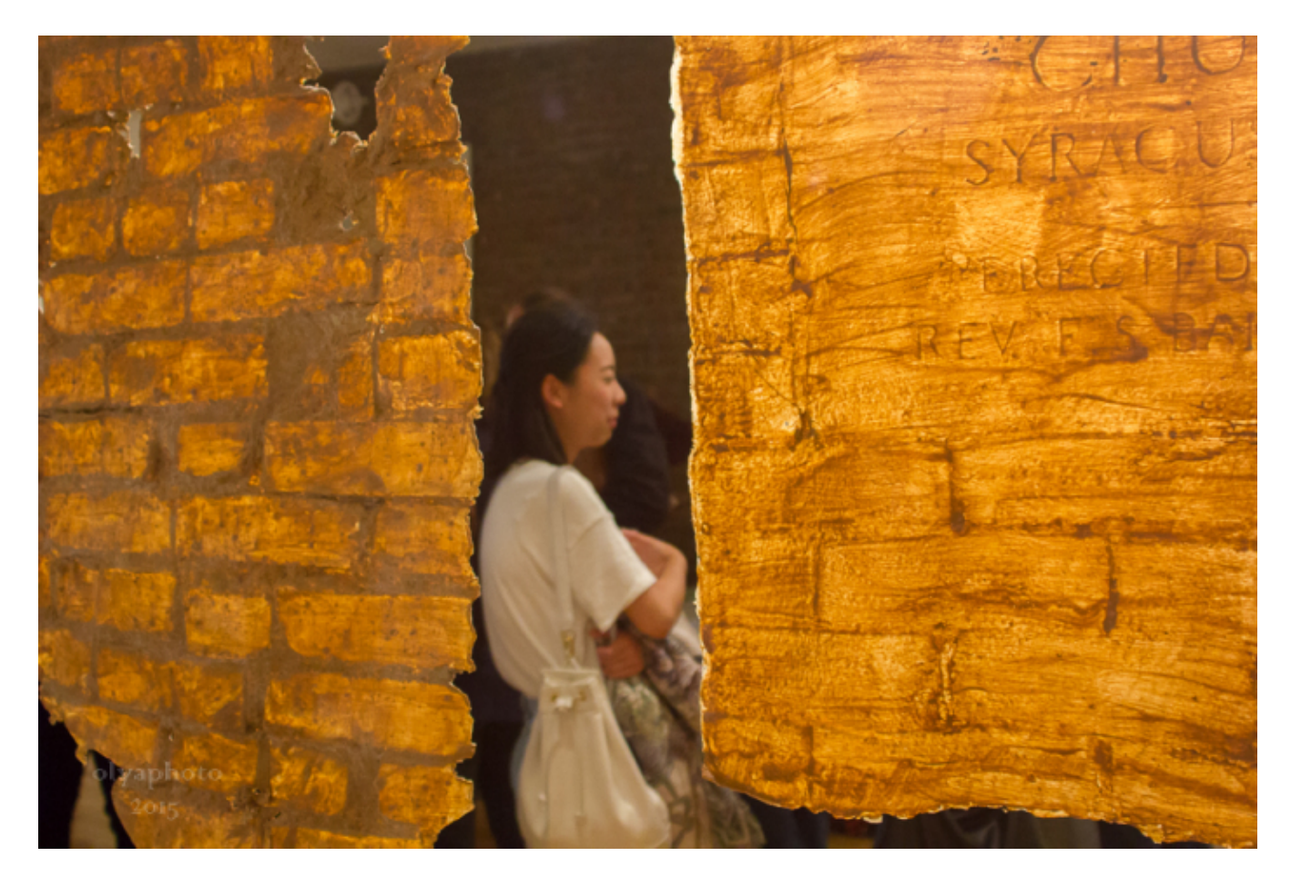
Art night at William Holman Gallery