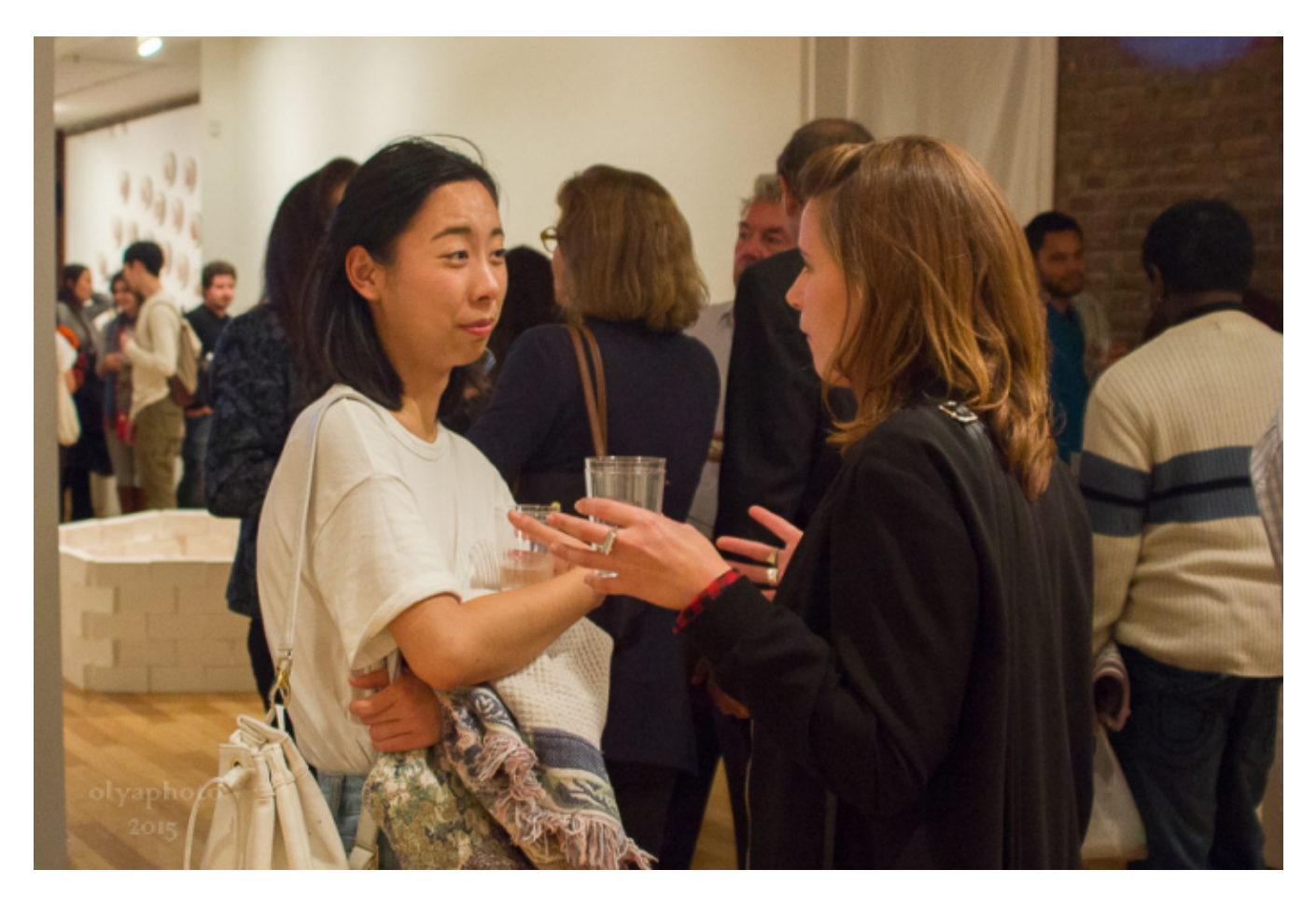
It is Art Night on the LES