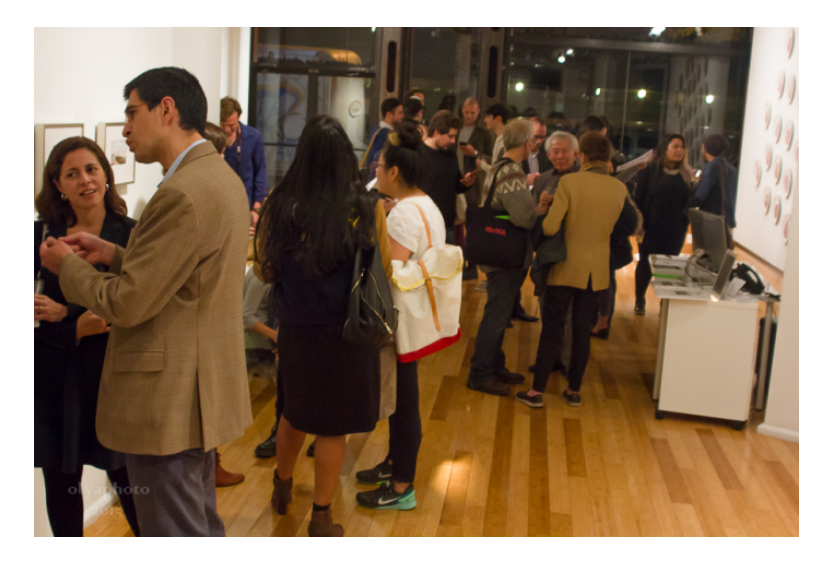
At William Holman Gallery on art night

Tactile features figured prominently in the latest show by Brazilian artist Liene Bosquê for Dismissed Traces last October 14th. With sculptures and installations inspired by history, architecture, or memories that Bosquê captivated with the rich nuanced textures of the works on view.