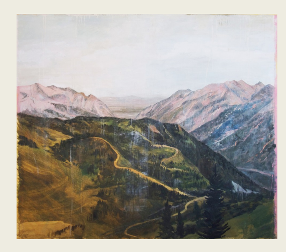
Mt. Shasta , 2015 Oil on canvas, 72 x 72 inches