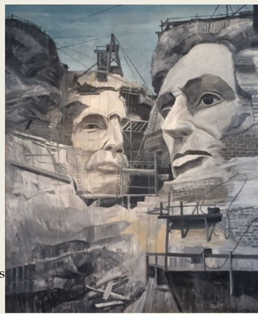
Mt. Rushmore , 2015 Oil on Canvas, 72 x 60 inches