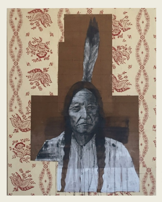
Sitting Bull, 2015 Acrylic and collage on panel, 40 x 32 inches