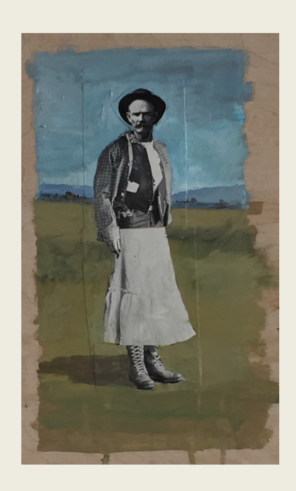
{\it Marlboro~Country,\,2015} \\ Acrylic and collage on panel, 14 <math>\times 8 inches