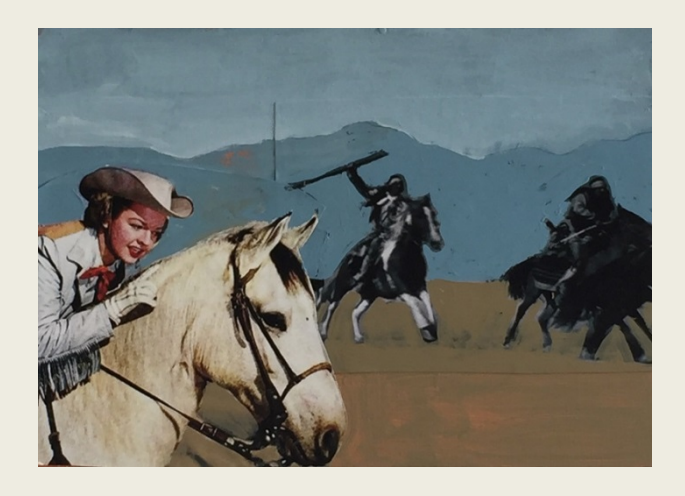
Dale Evans , 2015 Acrylic and collage on panel, 10 x 14 inches