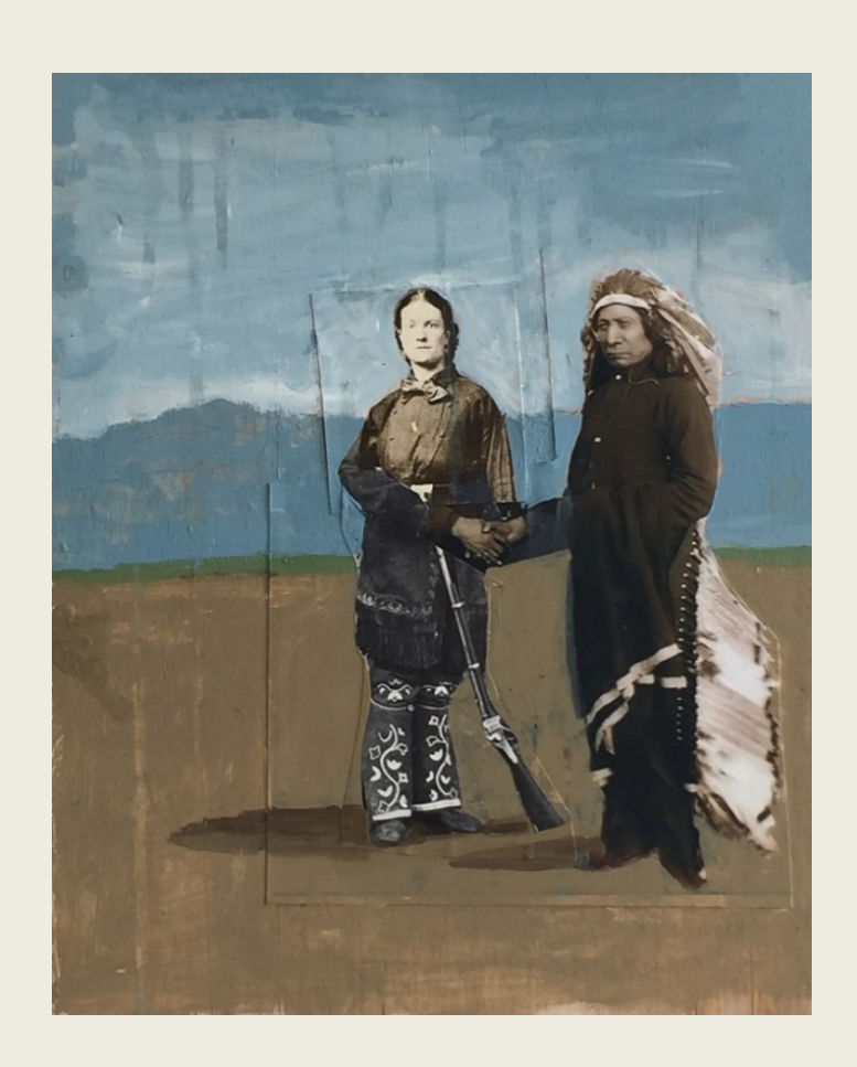
Handshake, 2015 Acrylic and collage on panel, 12 x 15 inches