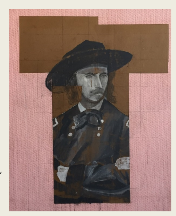
Custer, 2015 Acrylic and collage on panel, 40 x 32 inches