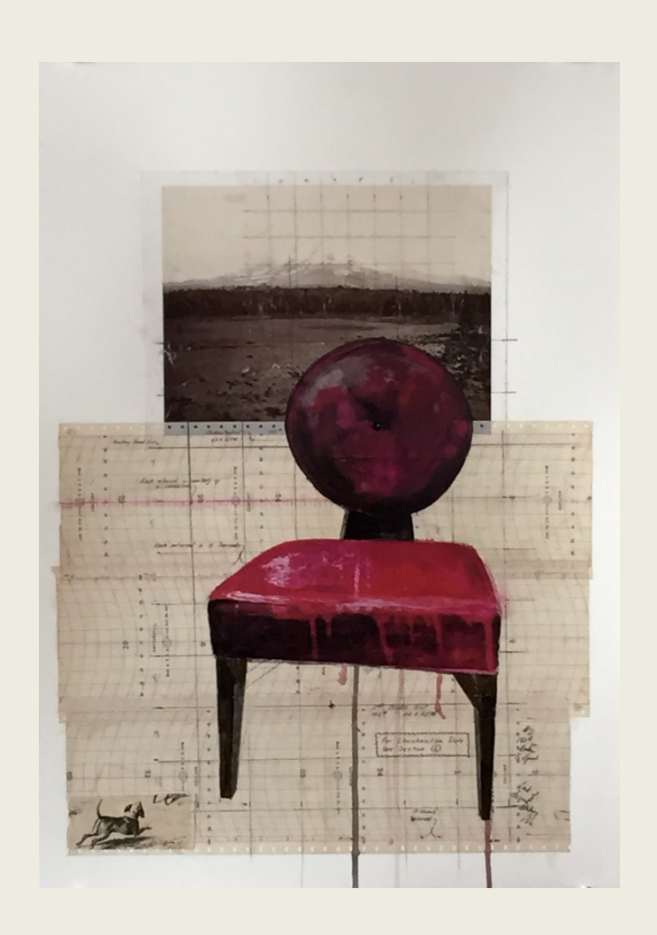
Devil Chair , 2015, Mixed media on paper, 32 x 20 inches