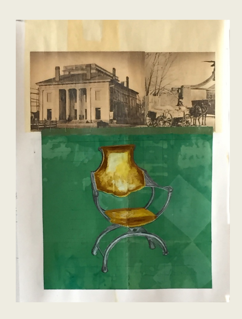
Planetarium , 2015 Mixed media on paper, 30 x 22 inches