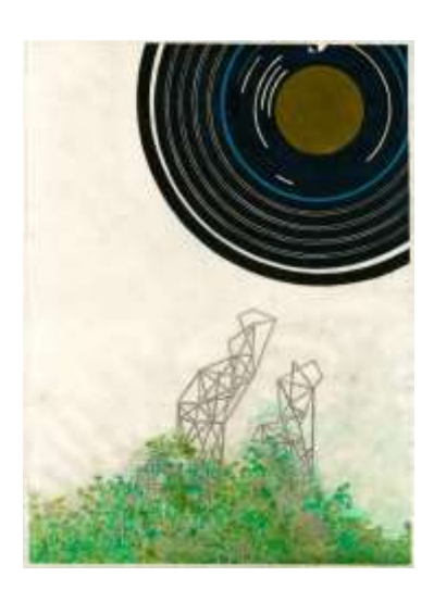
Koegel C. Adapted Structure, 2015, Watercolor on Paper, 30 x 22 Inches

The original word from Latin 'transversus' meaning "turn across", became, in the 14th century, an "act of passing through a gate, fortification or crossing a bridge", and later as a verb to "cross an area of land or water", and most recently in rock climbing as a sideways zig-zagging movement necessary in order to continue up or down a cliff - an essential detour.