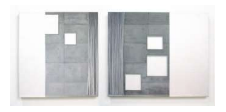
Frantiska + Tim Gilman, Untitled (Curtains), 2014, Oil on Canvas

65 LUDLOW STREET, NEW YORK, NY 10002 O. 212 475 1500 F. 212 475 1501